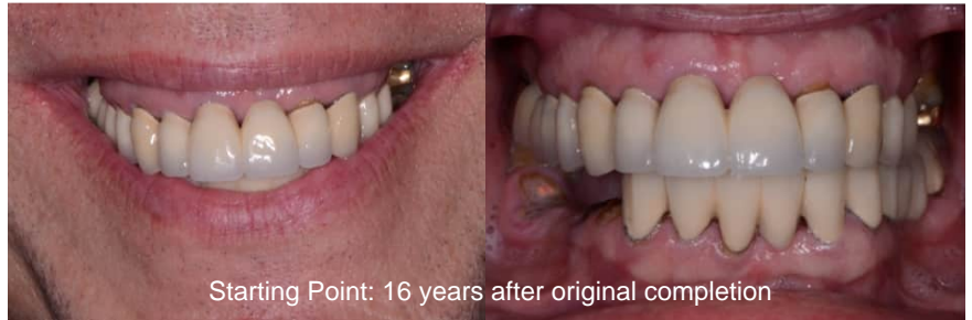
Starting Point: 16 years after original completion

Who has heard of “Geographic Success?” That is what dentists refer to when a patient moves away after completing a lot of dental work. Someone asks, “How did the treatment go?” Answer: “Great, the patient moved away!” What is out of sight is out of mind. However, we don’t learn unless we see our failures. Recently, I had the privilege of seeing one of my failures.