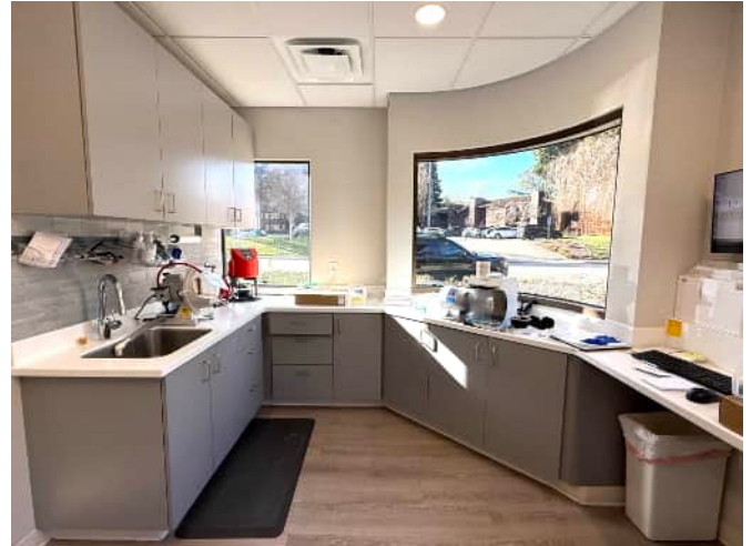
Individual Implants, Crowns, and Veneers

On-site Dental Lab where we make customized dental prosthetics