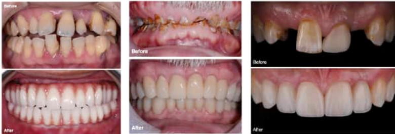
Full Arch Implants