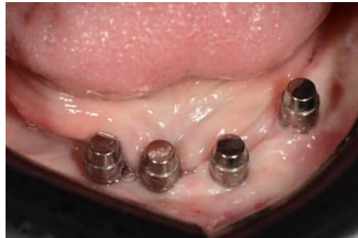
MAGNET-X Implant Overdenture