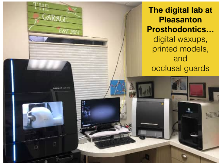
The digital lab at Pleasanton Prosthodontics... digital waxups, printed models, and occlusal guards